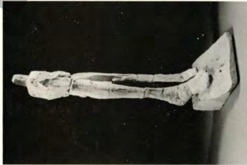
STEPHEN DE STAEBLER

"LEGS WITH BLUE SPLINT" 33 1/4" x 9" x 12" • CERAMIC 1996 - 98